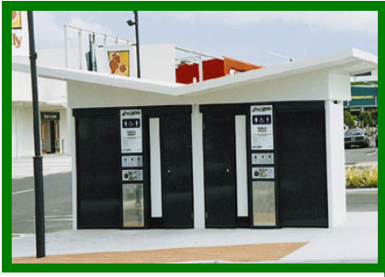
Coin operated units. Roof modified on site to match surrounding buildings