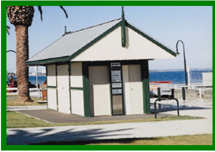
Greenwich layout with modified roof and wall panels added on site.

Units are locked by an exclusive concealed electromagnetic locking device.