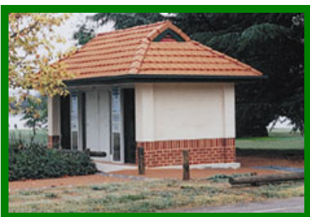
St Ives layout modified on site with terracotta roof and brickwork