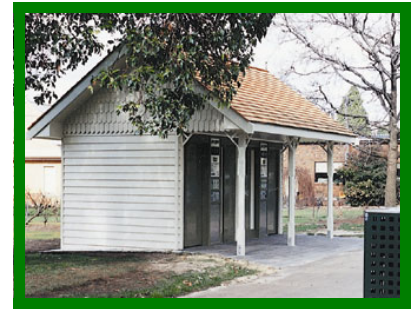
St Ives layout with weatherboards and gable roof added on site.

Vandal resistant signs show the status of the unit, its features and operating instructions.