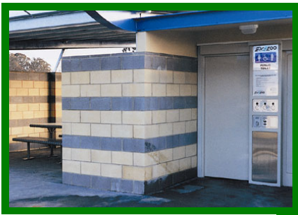
Single unit built into family picnic booth