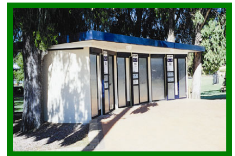
Three units in Brighton layout