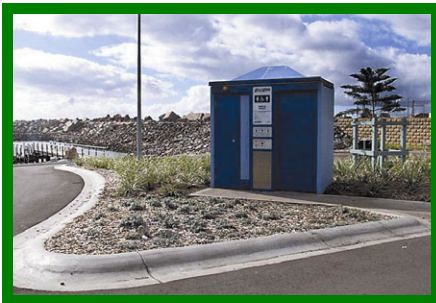
Single unit at boat ramp.