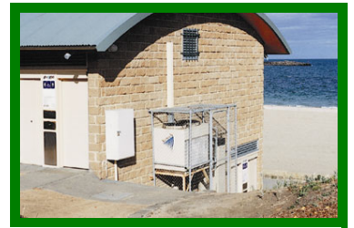
Two units incorporated into new life saving club