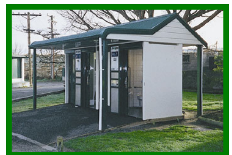
Heritage style units in St Ives layout.