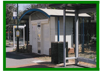
Single unit modified on site with exterior brickwork and roof

Our vision is to provide a public toilet facility which provides the highest standard of hygiene and safety for users, does not discriminate against the disabled, and discourages loitering or vandalism.