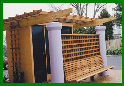
Single unit with columns and seat added.

A discrete stainless steel sharps disposal chute discharging to the service bay is available.