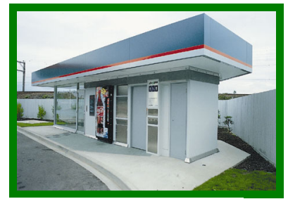
Card operated unit incorporated into service station building