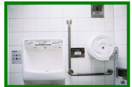
Sensor basin and electronic toilet tissue dispenser